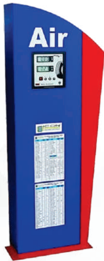
Digital Tyre Inflator