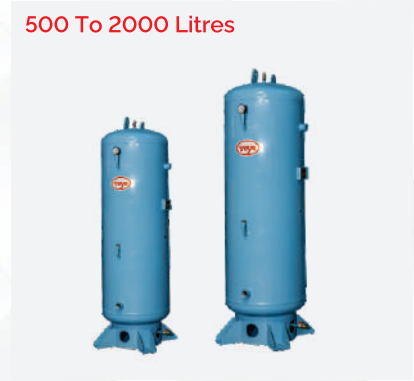
500 To 2000 Litres Vertical Receiver