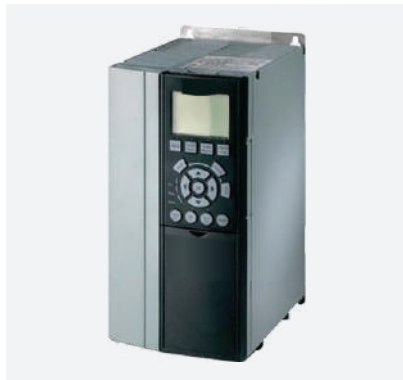
Variable Frequency Drive (VFD)*