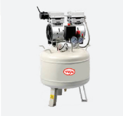
Oil Free Air Compressor