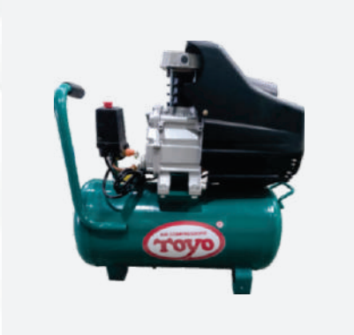
Portable Air Compressor