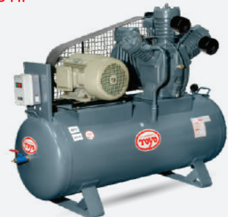
DSTY - 9