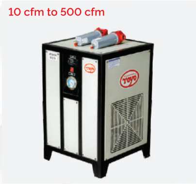
10 cfm to 500 cfm Refrigerated Air Dryer