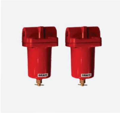
Pre Filter / Carbon Filter