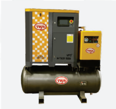
220 ltrs | 270 ltrs | 500 ltrs Tank Mounted